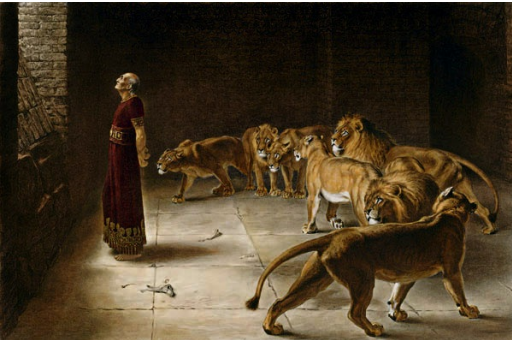
Daniel in the Lion's Den (Daniel 6)