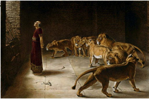
Daniel in the Lion's Den (Daniel 6)